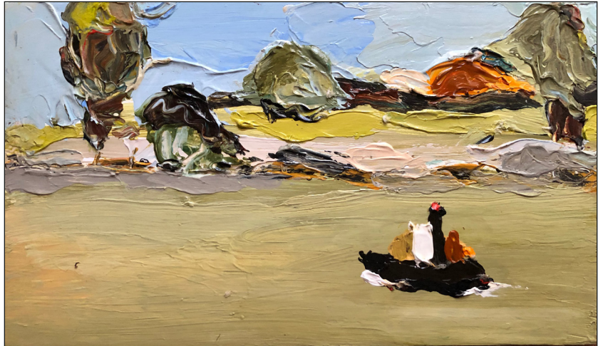
Suzanne Alexander, Black Wattle Bay